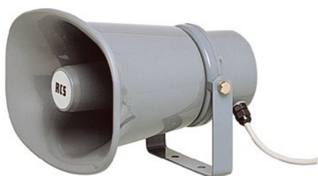
Horn Speaker, with 100V-transformer ..... DH-115S