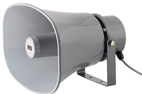
Horn Speaker, with 100V-transformer ..... DH-130S