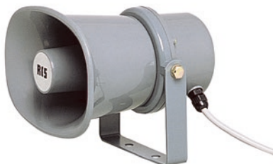
Horn Speaker, with 100V-transformer ..... DH-110S