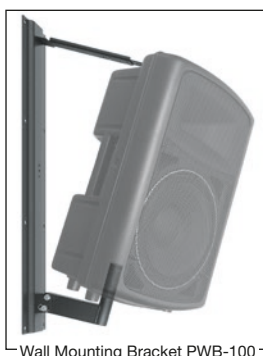
Wall Mounting Bracket PWB-100