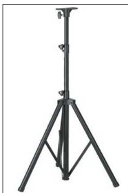
Floor Stand QST-185