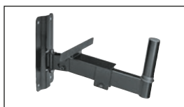
Wall Bracket QWH-035