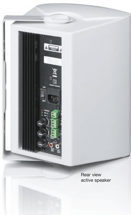
Rear view active speaker