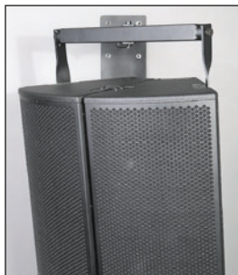
Wall Bracket (clustervariant)