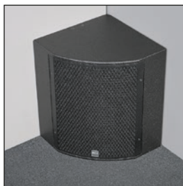
Corner mounting of QRI-108S/ST