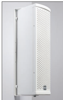
Wall bracket QWH-404 (U-Bracket)