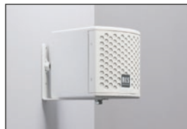
Wall bracket of QRI-401 (L-Bracket)