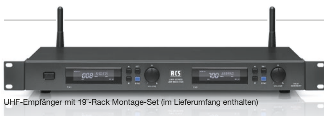
UHF-Empfänger mit 19"-Rack Montage-Set (im Lieferumfang enthalten) UHF-Receiver, 2x 700 frequencies, (630-660 MHz) . . . . . UWR-702 F complete with mains adapter and antennas

The frequencies used are generally assigned for professional users. It is no longer necessary to register for use.